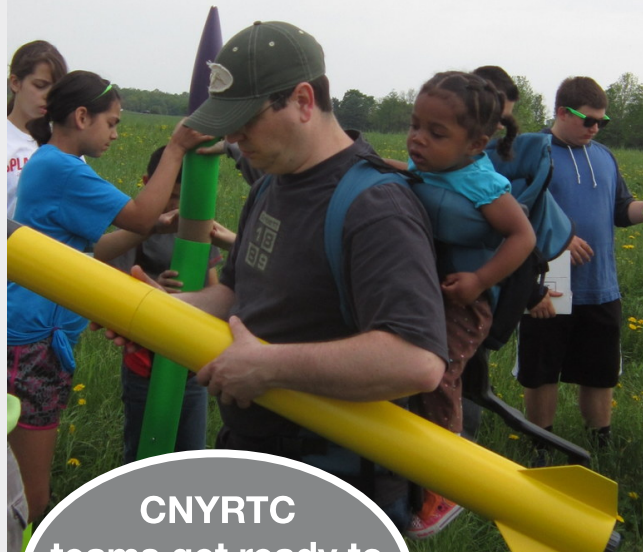
CNYRTC teams get ready to test at the May SRC launch

There were 67 flights, which was 67 more than May 2014, so the season's off to a good start.