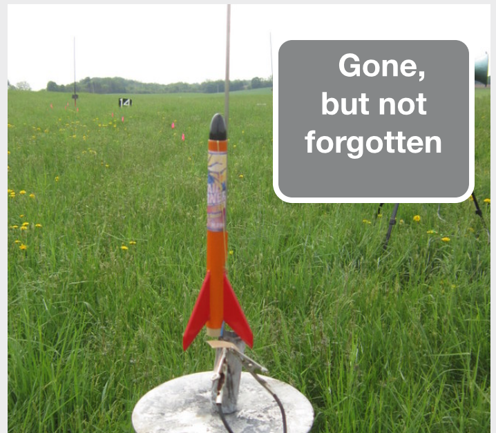
Gone, but not forgotten